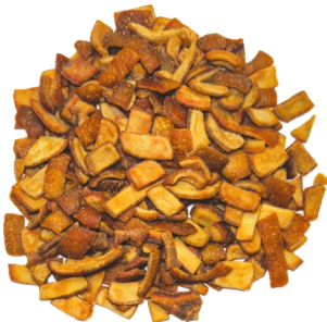
PORK CRACKLINS 65 LBS.