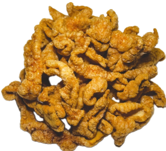
LONG TENDER FRIED PORK CRACKLINS 10 LBS.