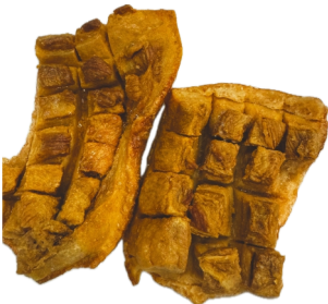
CHICHARRON PIÑADO 15 LBS.