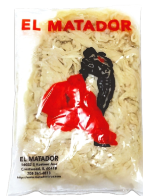
EL MATADOR® 38/40 WF PF 20 IN A BUCKET