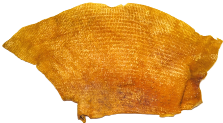
SANCOCHO PORK SKIN 20 LBS.